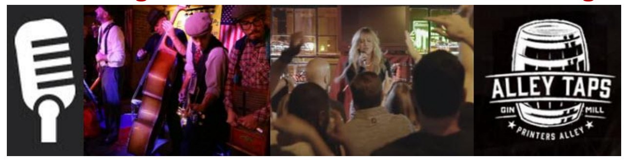
Please Note: Options #1-4 are regularly recurring; Options #5-7 are "live" during CMA Week.

1. Alley Taps - 4<sup>th</sup> Saturday Night of Each Month (5 shows up to June 2020.) Full promotional run of the house!